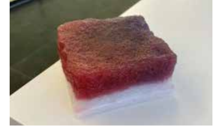
Project: LED paving stone

Benefit: Very high transparency due to high transmission values