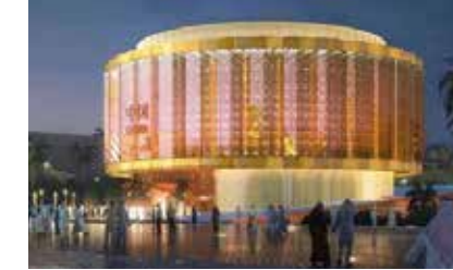
Project: Flexible LED curtain for EXPO 2020

Benefit: Material also available in cartridges